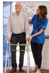
SAFER HOMES MEANS REDUCED HEALTHCARE COSTS