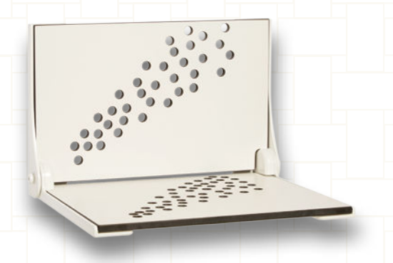
Silhouette High Back Seat 18"