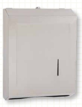
Wall Mounted C-Fold Tissue Paper Dispenser