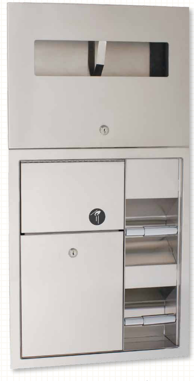
Recessed Seat Cover Dispenser, Napkin Disposal and Toilet Tissue Dispenser (Women's) w/ Lock

Visit our website to view our full line of products, individual photos, descriptions, and downloads with specifications.