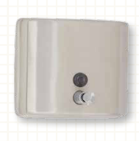
Fresh Wall Soap Dispenser