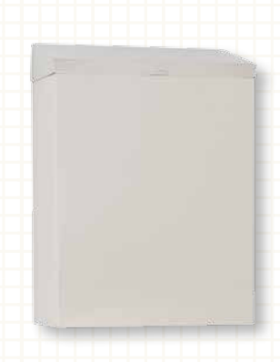
Sanitary Napkin Disposal