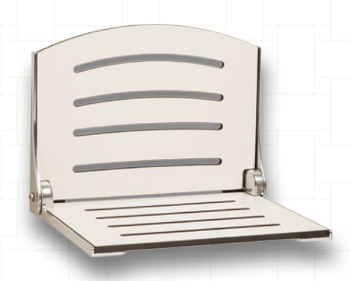
Silhouette Arched High Back Seat 18"