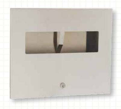
Recessed Toilet Seat Cover Dispenser