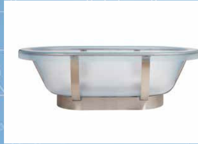
A contemporary design for a custom, premium acrylic and stainless steel tub