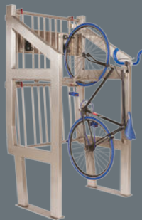
AMTRAK BIKE RACK

Your partnership with H & H Bath and Safety benefits from our longtime specialization in developing the safest and most comfortable grab bars, seats, support frames, and other accessory products. Our expansive engineering and manufacturing facility boasts state-of-the-art CAD/CAM capabilities and precision metal production. Our commitment to USA-made quality and in-depth knowledge of the Americans with Disabilities Act assures that any products we manufacture for you meet the highest standards of safety, support, strength and function. Most importantly, we believe in creating lasting relationships, with a dedication to service and pride in the end results that have helped us build a worldwide reputation in custom fabrication for any applications.