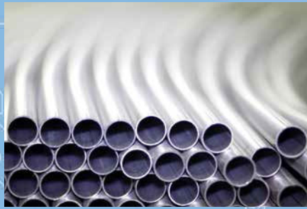
H & H Bath and Safety products are made from the highest quality materials