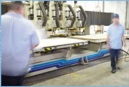
High-volume production made efficient using state-of-the-art CNC machinery