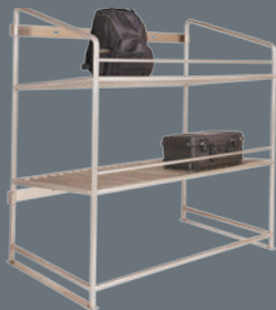
AMTRAK LUGGAGE RACK